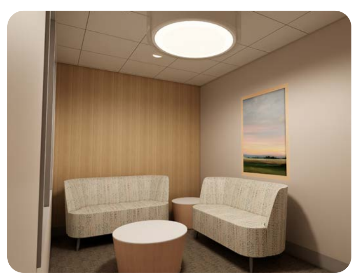
EmPath Unit: Family Room

Behavioral health crisis conditions are a significant – and growing – concern in the state and throughout the country. Nationwide, 1 in every 8 Emergency Department (ED) visits involve a behavioral health issue or substance use disorder. At Griffin Hospital, approximately 1 in every 7 patients come to its ED for help with a psychiatric crisis. Griffin seeks to compassionately address the specialized needs of these individuals by building an EmPATH Unit.